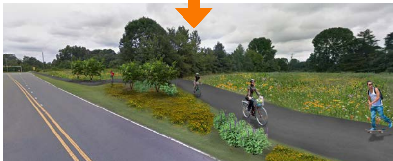
Proposed Greenway Sidepath along Rural Retreat Rd